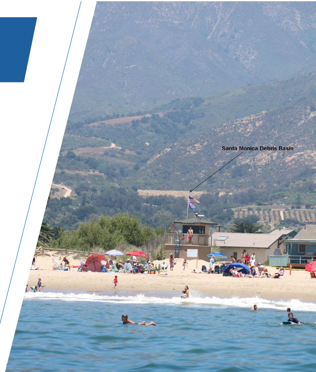
Santa Monica Debris Basin