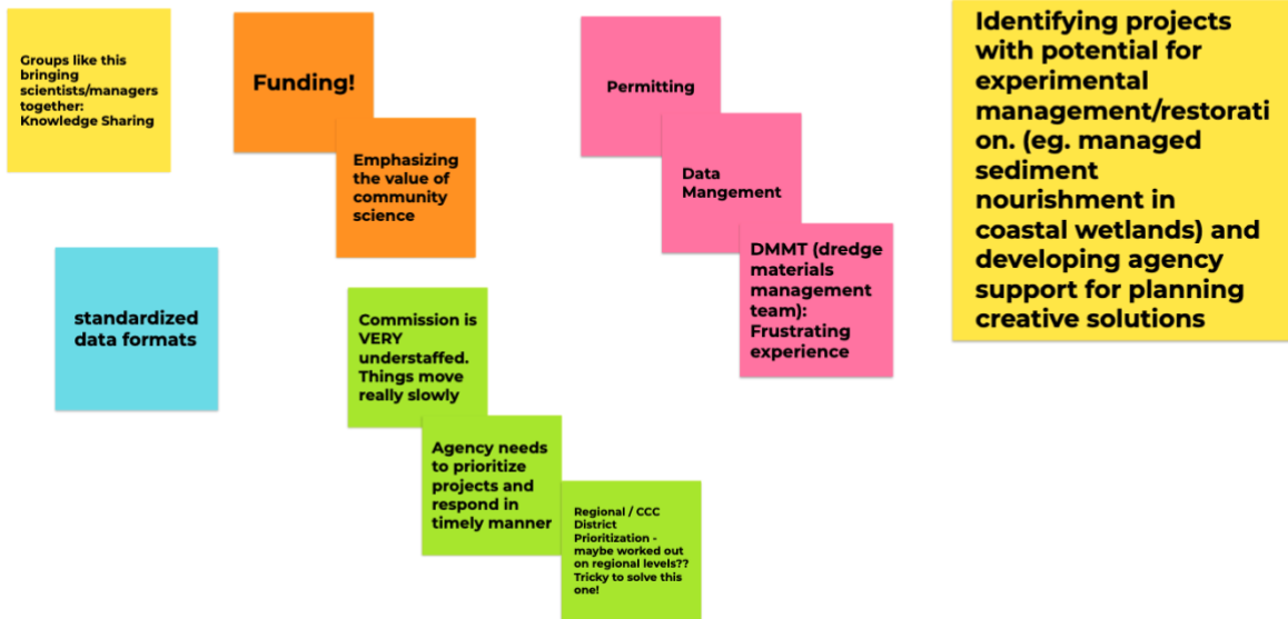
Screengrab from Group 3's Jamboard discussion

Can you suggest any opportunities/strategies/actions to overcoming barriers (e.g., knowledge/science and access to knowledge/science)? Specific examples preferred.