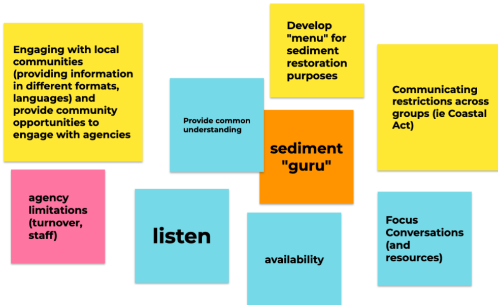
Screengrab from Group 2's Jamboard discussion

Can you suggest any opportunities/strategies/actions to overcoming barriers (e.g., knowledge/science and access to knowledge/science)? Specific examples preferred.