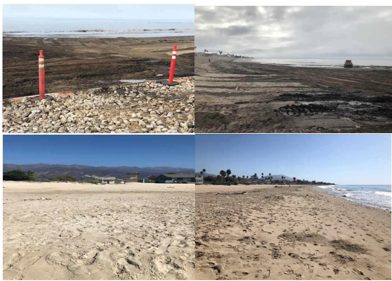
Carpinteria City Beach During Beach Nourishment and After Beach Nourishment: 2019

The BEACON beach nourishment goal is driven in large part on the desire of local citizens and local member agencies to preserve area beaches for public access and recreation. It is paramount that BEACON beach nourishment and enhancement projects be designed and implemented to preserve the use of beach areas for public access and coastal recreation.