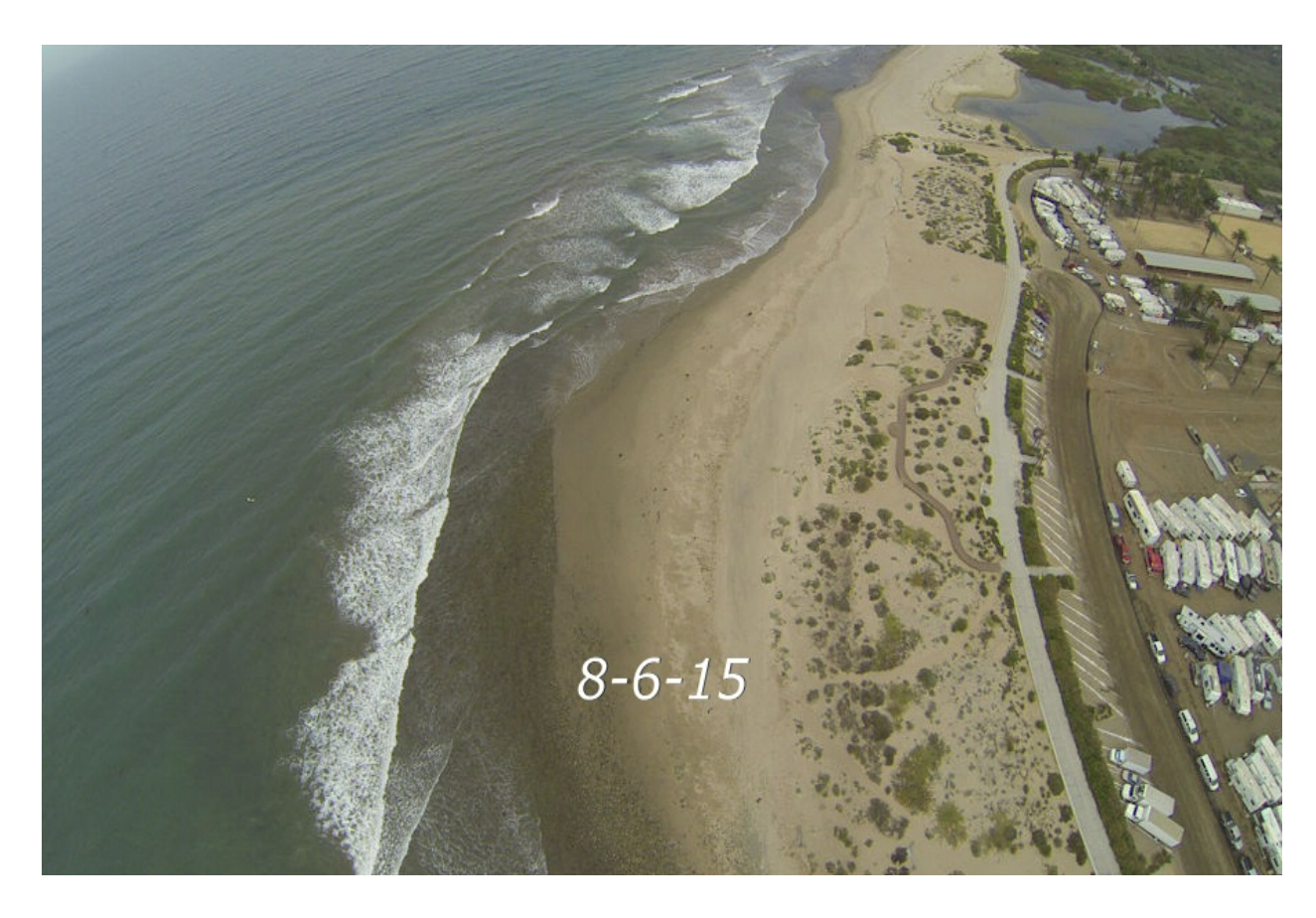
Surfers Point Phase 1 Cobble, sand beach and dunes 'Living Shoreline'