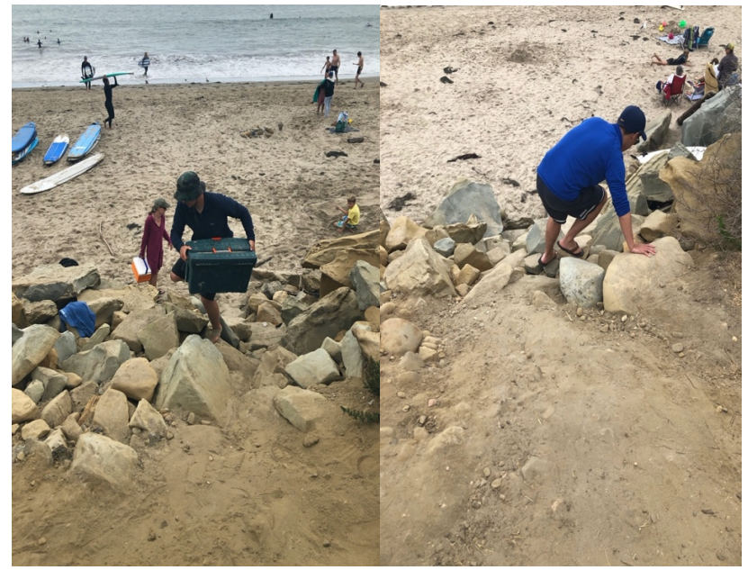
Currently No Safe Public Access to Beach