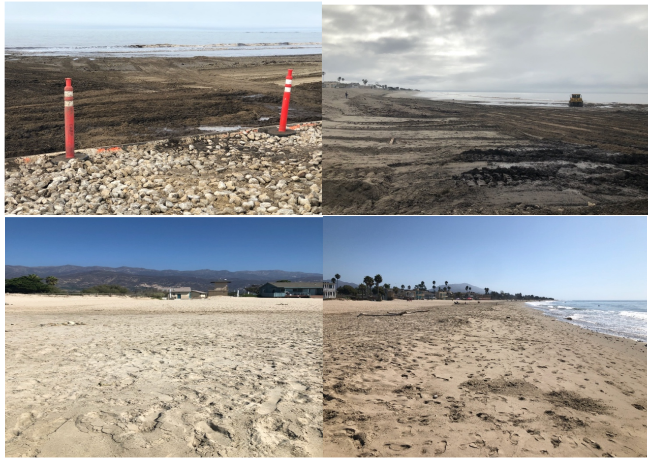
Carpinteria City Beach During Beach Nourishment and After Beach Nourishment: 2019

The BEACON beach nourishment goal is driven in large part on the desire of local citizens and local member agencies to preserve area beaches for public access and recreation. It is paramount that BEACON beach nourishment and enhancement projects be designed and implemented to preserve the use of beach areas for public access and coastal recreation.