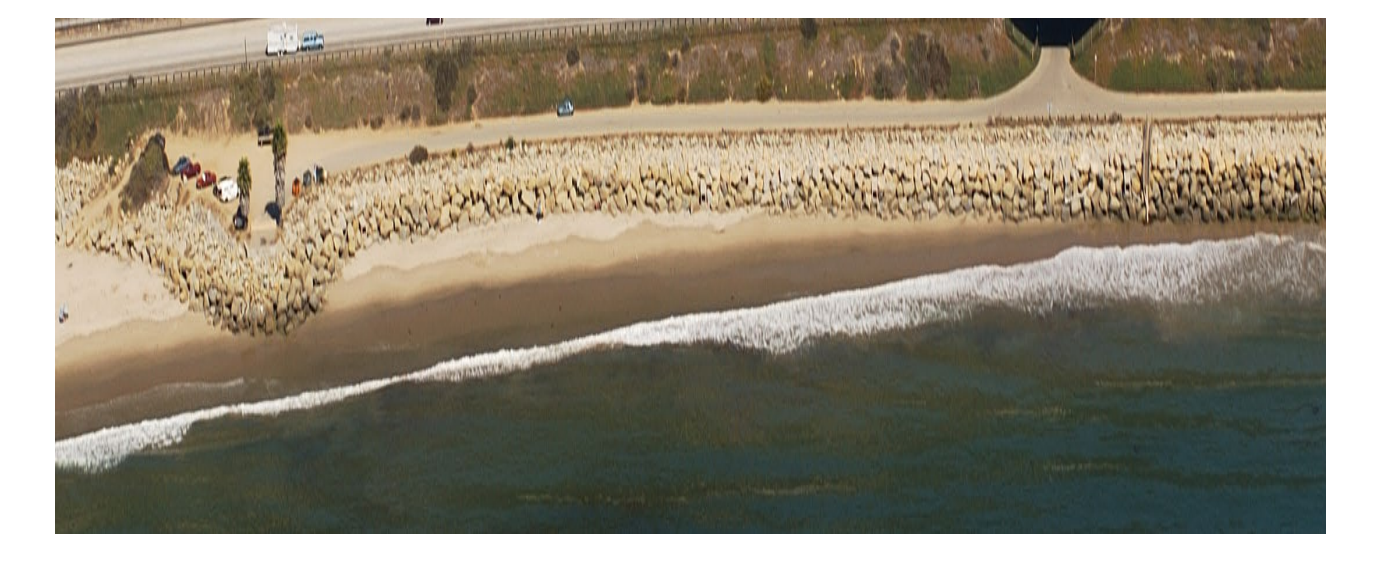
Figure 1. Oil Piers

Meeting Date: September 20, 2019 Agenda Item: 9 Page 3