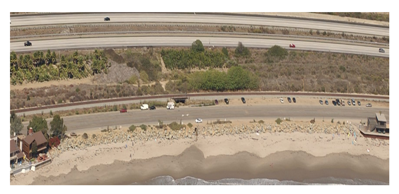
Figure 2. Mondo's Cove