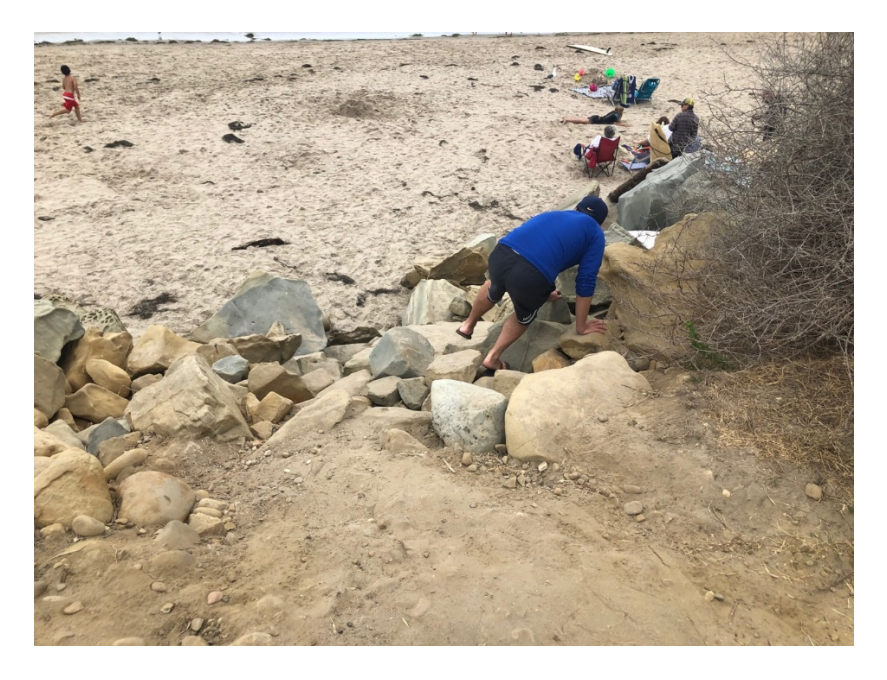
Figure 4. Scrambling down to the beach over the riprap