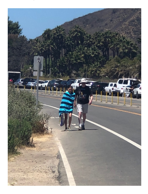
Figure 7. Pedestrian, Bicycle and Road Conflicts Present Hazards at Mondo's

Figure 6. Scrambling down to beach with beach gear