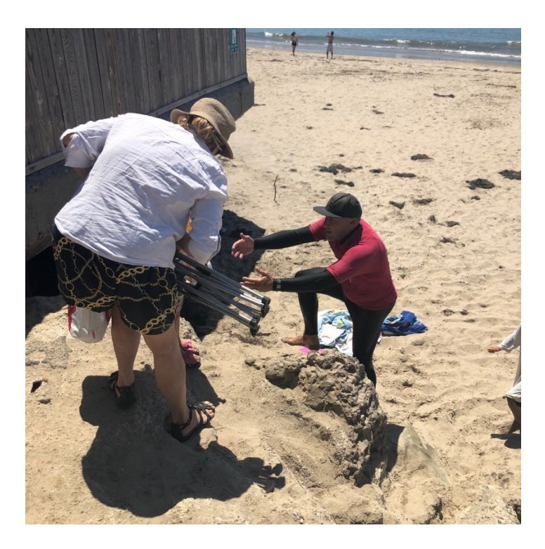
Figure 6. Scrambling down to beach with beach gear